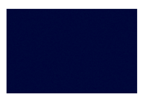
Fathom Blue Pearl • B-576P