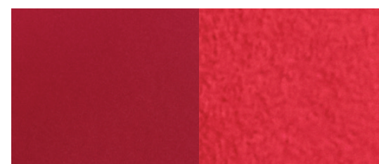
Red Leatherette with microsuede