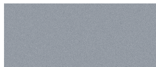
Lunar Silver Metallic