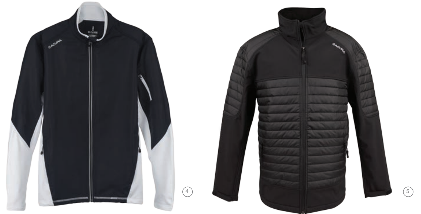
(4) MEN'S SONOMA HYBRID JACKET 200219187 - $78.00

100% polyester polo with anti-snap and anti-bacterial properties. Four button placket. Sizes: M-2XL