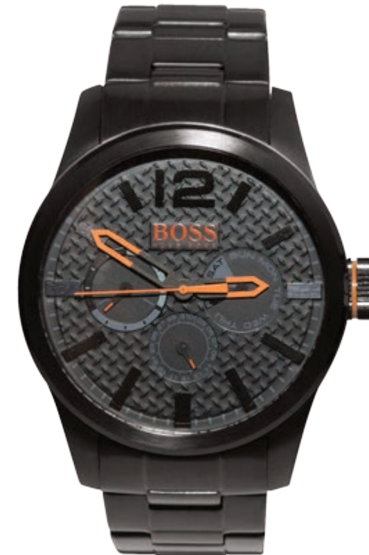
CHRONOGRAPH BLACK IP STRAP WATCH BY BOSS ORANGE 200250487 - $265.00

With a street style edge, this BOSS watch features stainless steel, IP construction and contrast logo details. Stainless steel IP case measuring 46 mm (1.8 in.) • IP stainless steel strap • Black dial with logo detail 3-eye quartz chronograph movement • Water resistant: 5 ATM (165 feet) • Two-year limited warranty Market Value $285.00