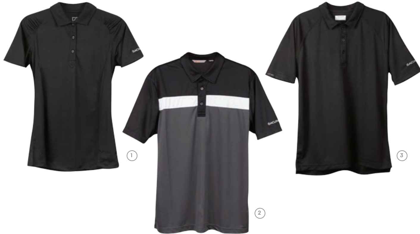
(1) LADIES' CUTTER & BUCK MADEMOISELLE POLO 200250308 - $48.50

100% performance polyester. Gathering at front raglan sleeve. Moisture wicking and 50+ UPF sun protection. Sizes: S-XL